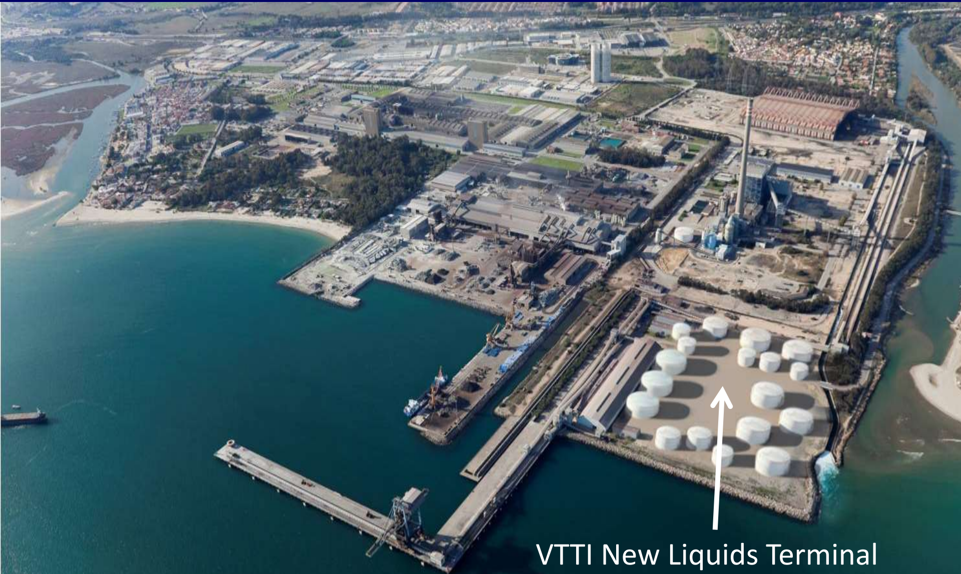
VTTI New Liquids Terminal